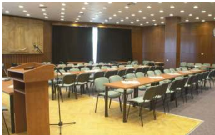
The hotel's congress hall