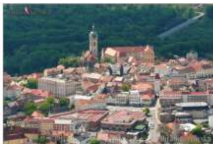
The Mělník Castle

The constant wars in the Czech lands meant hard times, which was also reflected in vine cultivation and in the trade of wine. A significant decline was experienced during the Thirty Years' War in the 17th century, and also